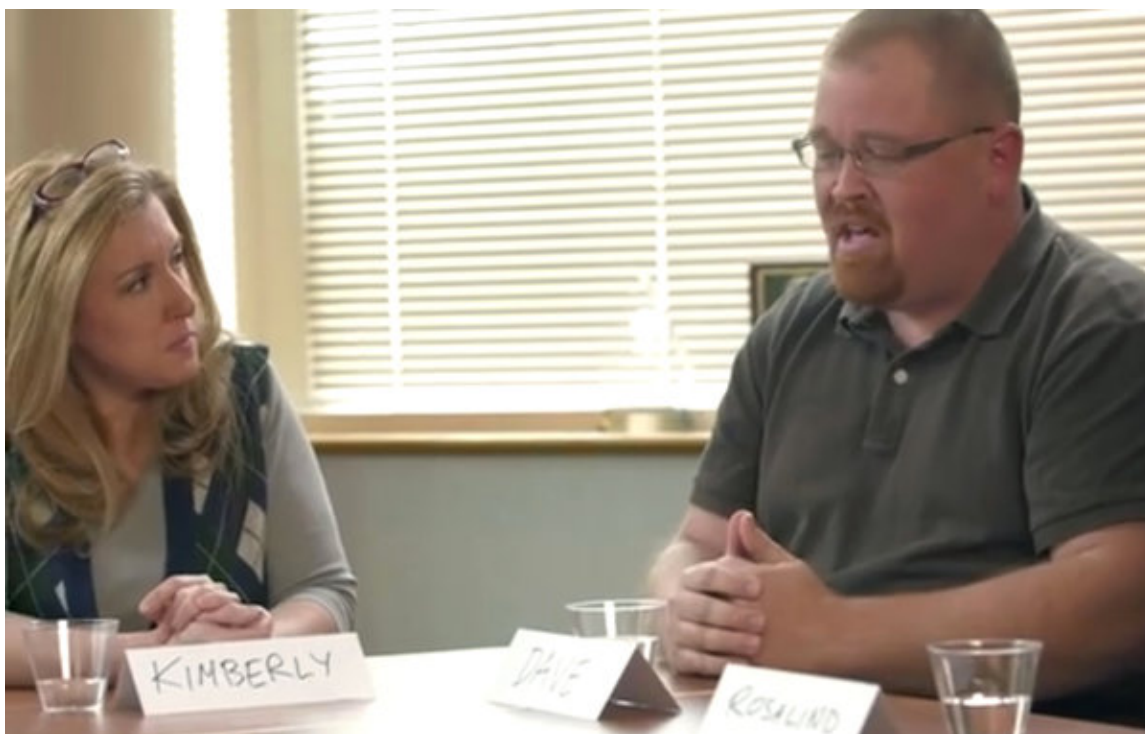
In an ad paid for by the New Jersey Education Association, a father talks about his son crying because of tests.

“It’s an effort to undermine accountability,” he added.